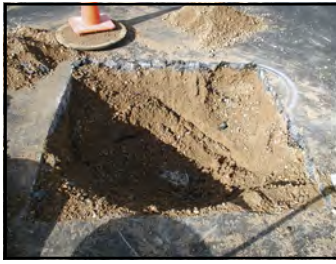
Expose the manhole