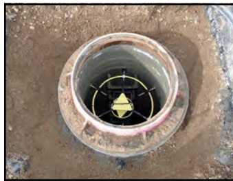
Clean off and remove rubber stopper