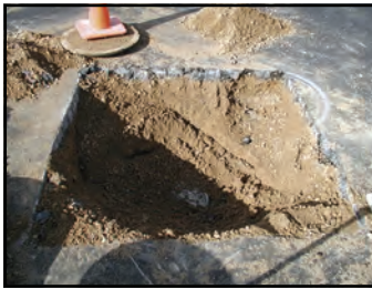
Expose the manhole