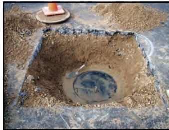
Insert catcher assembly and rubber stopper