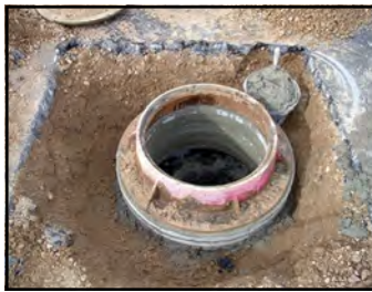
Install manhole casting