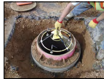
Remove catcher assembly

Save time and MONEY, plus eliminate the need for confined space entry.