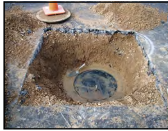
Insert catcher assembly and rubber stopper