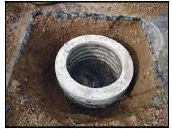
Build up using manhole adjusting rings